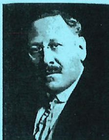
HON. JULIUS ROSENWALD