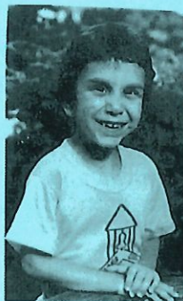
(1978 – 1988)